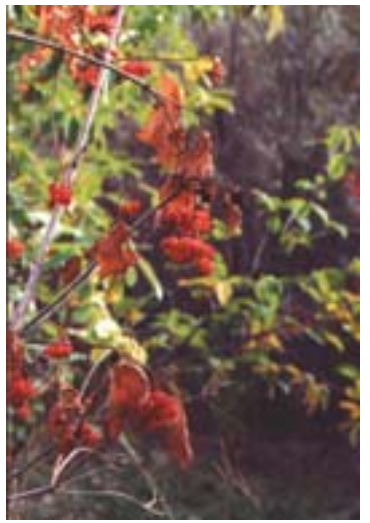
Mountain Ash berries

Fifteen years later, Dragon's Eye Nursery farm looks more like an enchanted forest than a 'traditional farm'. It has succeeded in providing a space for year round grazing, both for humans and for wildlife. And since much of the food either grows on the trees or on plants trellised up the trees, back-ache from leaning over is almost unheard of here.